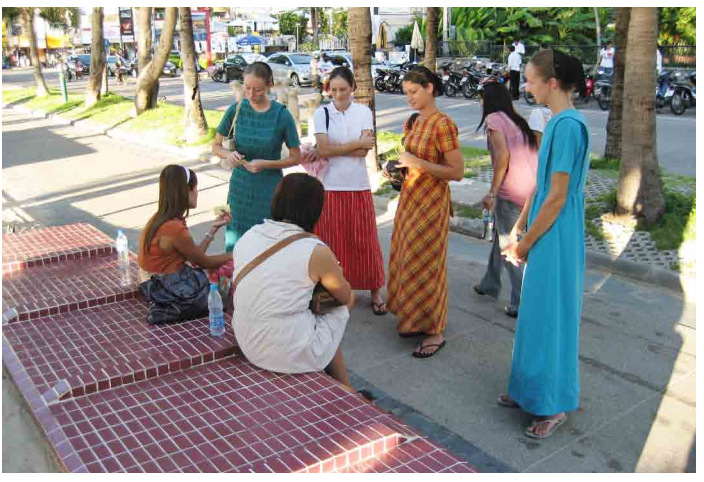
TALKING WITH GIRLS IN PATTAYA, THAILAND

think I made him feel guilty without even doing any thing, because he seemed to feel the need to explain to me why he was here and how he has been helping them. When I told him what we were doing, he told me exactly what we were doing wrong. It felt like another attack from the enemy and a distraction to the reason why I was there. Tonight one of the older women at the bar I went to was crying on my shoulder, and it just broke my heart, to see and feel her pain. It's just so incredibly dark and evil and sometimes it just really hits me hard again! There is nothing like going and spending some quality time with God especially after these times. He is the ONLY answer to all of this pain.