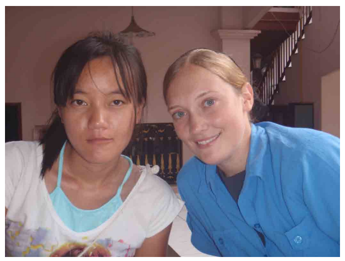
THESE WOMEN DESPERATELY NEED HELP. THEY NEED AN ENCOUNTER WITH THE RADICAL LIFE TRANSFORMING LOVE OF JESUS CHRIST WHO DIED AND ROSE AGAIN TO SAVE US ALL FROM OURSELVES AND THE ADULTERIES OF OUR HEARTS.